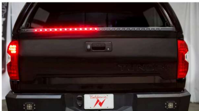
Left Turn Signal

Phillips screwdriver, T30 TORX bit, pliers, wire cutters, electrical tape and panel popper