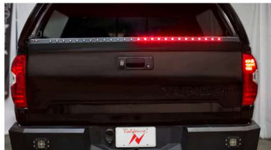
Right Turn Signal