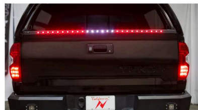
Reverse With Red L.E.D.'s

AnzoUSA™ products are covered, by a limited one (1) year warranty, to be free of manufacturer's defects. However, certain AnzoUSA™ product categories have warranty policies which differ from this standard. Please contact your representative for detailed category information. Damage due to improper installation or road hazards is not covered. Seller and manufacturers' only obligations shall be to replace the product proven to be defective. Neither seller nor manufacturer shall be liable for any injury, loss or damage, direct or consequential, arising out of the use of or the inability to use the product. Before using, user shall determine the suitability of the product for its intended use, and user assumes all risk and liability whatsoever in connection therewith.