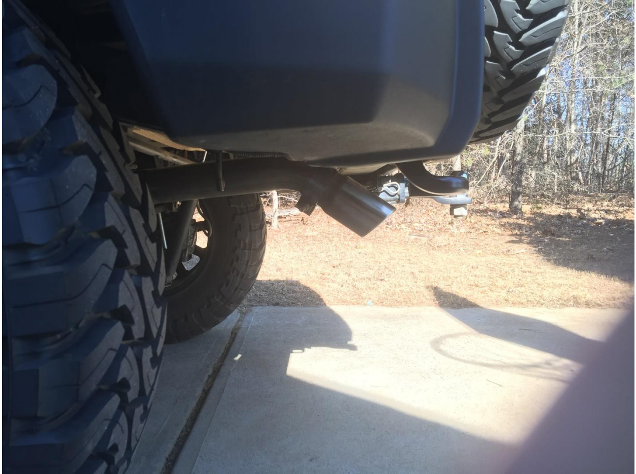
Installation Instructions Written by ExtremeTerrain Customer Evan Crook 2/29/16