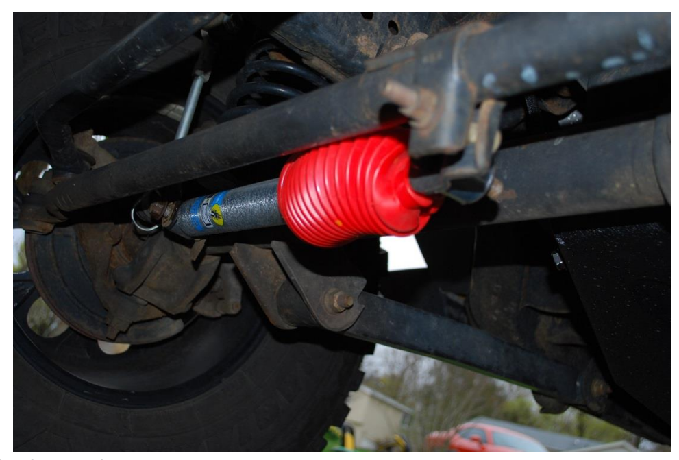
11. Your installation is complete.

Installation Instructions Written by ExtremeTerrain Customer 10872426 4/12/2017