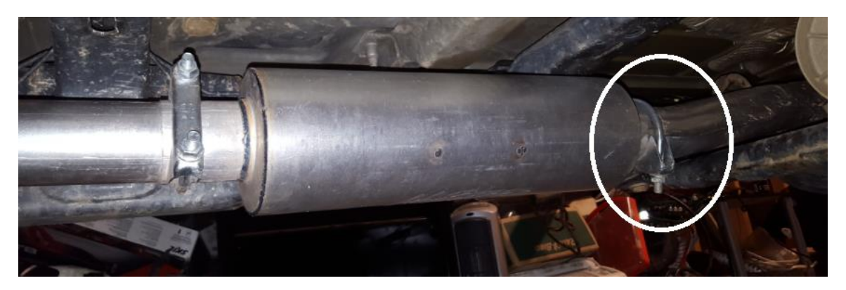
10. Install the third 2\frac{1}{2} " clamp over the new muffler and slide on the "over the axle pipe" to the muffler.

9. Slide a second 2 \frac{1}{2} " clamp over the extension pipe and install the new MBRP muffler. Remember don't tighten any clamps till final adjustment.