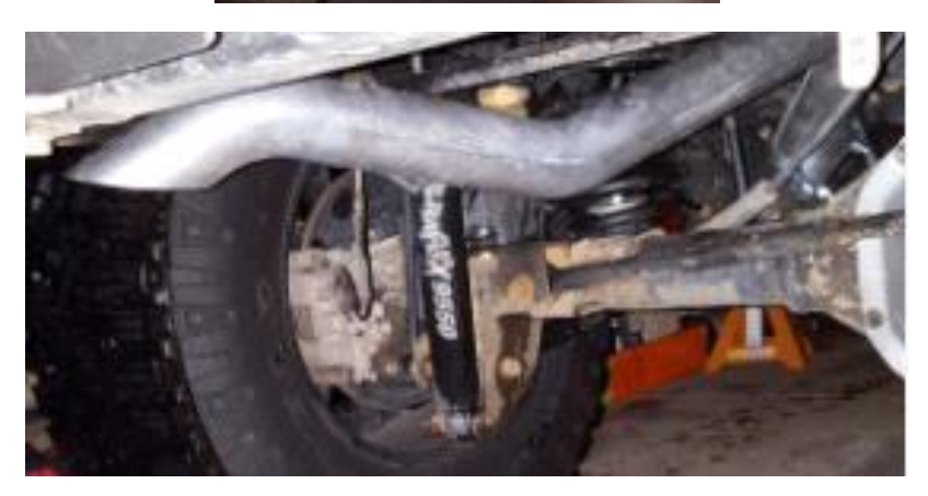
Installation Instructions Written by ExtremeTerrain Customer Brian Strand 8/25/2015