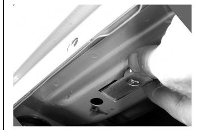
Fig 4 Driver side front shown