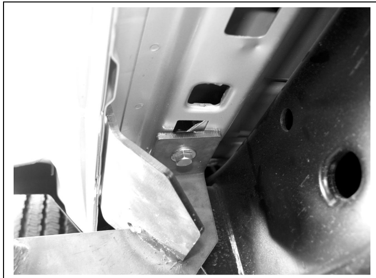
Fig 5 driver side front bracket shown