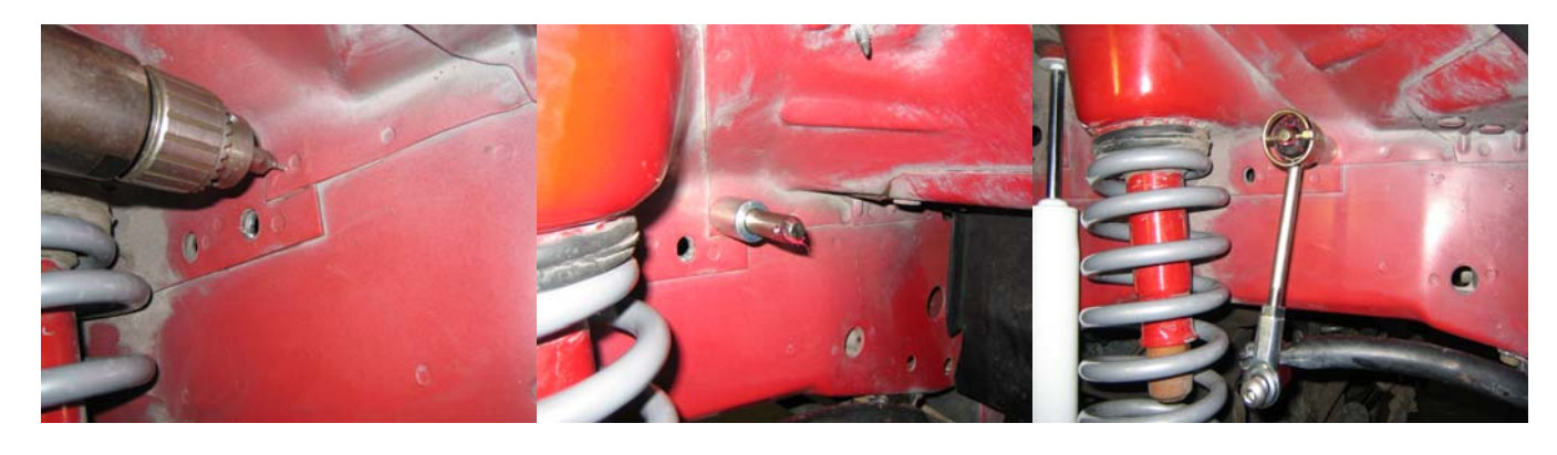
\begin{tabular}{ll} \textbf{PICTURE -B-}\\ \textbf{MOUNTING PIN HOLE LOCATION \& MOUNTING ORENTATION FOR ALL XJ \& ZJ'S, W/O RE SWAY BAR RELOCATION BRACKETS (P/N RE9921) \\ \end{tabular}

FOR 2-3.5" LIFTS, 9" DISCONNECTS ARE USED (P/N RE1141), MOUNT PIN APPROX 2" FOREWARD FROM ABOVE POSITION FOR 0-2" LIFTS, 7" DISCONNECTS ARE USED (P/N RE1140), MOUNT PIN APPROX 4" FOREWARD FROM ABOVE POSITION