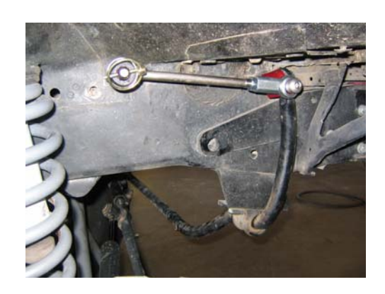
MOUNTING ORIENTATION FOR ALL XJ & ZJ'S WITH RE SWAY BAR RELOCATION BRACKETS (P/N RE921)