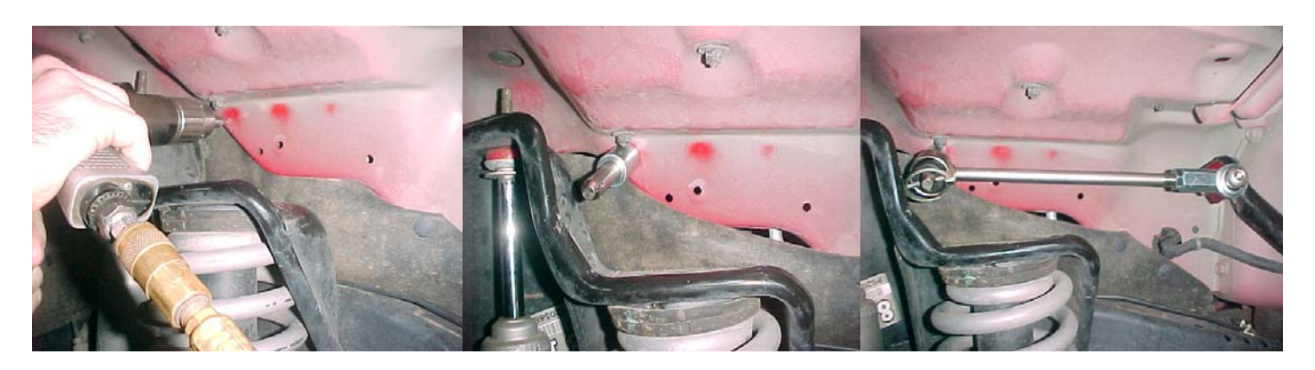
PICTURE -A- MOUNTING PIN HOLE LOCATION & MOUNTING ORENTATION FOR ALL TJ'S