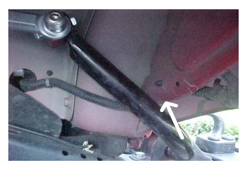
1. FOR 11" TJ DISCONNECTS (P/N RE1142), IT IS NECESSARY TO SLIGHTLY BEND FORWARD, THE LOWER PART OF THE FENDER SUPPORT STRUCTURE, TO MAKE CLEARANCE FOR THE SWAY BAR LEVER.