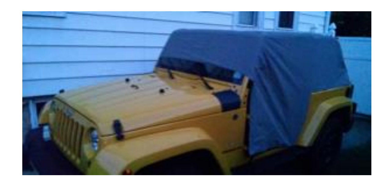
Installation Instructions Written by ExtremeTerrain Customer Lori Namerow 06/17/2016