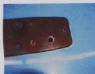
Figure 3. The first hole needs to be drilled in this location through the hinge and outer door.

Figure 2 is of an installation that requires drilling several holes in each door. A no-drill installation is also possible if desired. A significant amount of wiring will be exposed though.