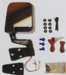
Figure 1 Kit includes one each of RIGHT and LEFT mirrors, all required wiring and hardware.

This mirror kit is designed to enhance the appearance of your Jeep. This kit can be used on all Wranglers, with half and full doors. Some models may require upper door hinges that are machined to accept the mirrors. The mirrors can be wired to operate with vehicle turn and/or parking lights. Installation and wiring processes may vary slightly based upon the model, year, and door type.