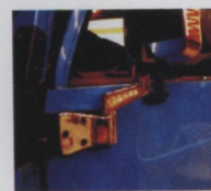
Figure 11 The initial systems checks proved that all lighting functioned properly, and our Jeepin' buddies were impressed with the cool new looks.