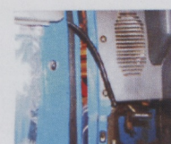
Figure 5. The wires and loom can then be pulled through the door, and the mirror fastened to the door. Be sure to leave the wires long enough to provide for full door movement. Then install the provided male 4-pin plug and terminals. Wiring

these plugs into the system will make future door removal quick and easy.