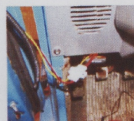
Figure 10. The final installation steps. Be sure wires correspond on both plugs. Place wiring in the loom. Tuck plugs behind dash. Test all light functions.

Once these connections have been made the wires can be routed to the right and left sides of the vehicle; proper length can be determined, and the plugs can be installed. Make certain that both the male and female ends of the plugs are wired to correspond correctly.