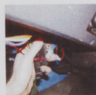
Figure 8. Use the crimp-on splice connector and spade terminal to make the wiring connection. The RED (Turn) on the left mirror is being spliced into the necessary wire on the turn signal switch harness. The same splices were done for the remaining turn, and park wires.

These wires need to be integrated into the vehicle wiring harness. Plugs are included to allow for easy removal of the doors. A test light and/or manual will be helpful. The 1990 YJ wiring required the parking lights to be wired into the Blue wire on the headlight switch harness. LEFT turn to be wired into the Gray/Black, RIGHT into the Brown, both on the turn signal switch harness. The colors and locations may be different on other vehicles. Use the test light to carefully test and locate the required wires.