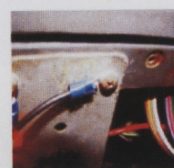
Figure 9. Terminals were crimped onto the Black ground wires and then they were placed under existing screws in the metal dash.

Once these connections have been made the wires can be routed to the right and left sides of the vehicle; proper length can be determined, and the plugs can be installed. Make certain that both the male and female ends of the plugs are wired to correspond correctly.