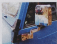
Figure 2. There is no exposed wiring on the outside of the vehicle. This requires drilling holes in the doors and routing wires through the doors. Less exposed wiring provides a cleaner look with less chance of snags.

The mirror assemblies bolt directly to the upper door hinges on half and full doors utilizing the same hole locations that held the OE mirrors. The mirrors can be installed on other models either by drilling and tapping the upper door hinges or installing a pair of upper door hinges that are already machined to accept mirrors. The kit can be installed in a number of possible mounting and wiring configurations, some more involved than others. The following installation was performed on a 1990 YJ