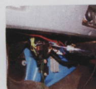
Figure 7 Locate and determine the wires needed. A wiring diagram and/or test light will be helpful