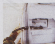
Figure 4. This cut-away of a door shows the required location of the second hole. It was necessary to locate the hole nearer the inside of the door to avoid hitting the lower section of the window channel. The wire loom shows the desired wire routing.