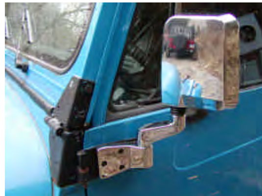
Figure 2. There is no exposed wiring on the outside of the vehicle. This requires drilling holes in the doors and routing wires through the doors. Less exposed wiring provides a cleaner look with less chance of snags.

The mirror assemblies bolt directly to the upper door hinges on half and full doors utilizing the same hole locations that held the OE mirrors. The mirrors can be installed on other models either by drilling and tapping the upper door hinges or installing a pair of upper door hinges that are already machined to accept mirrors. The kit can be installed in a number of possible mounting and wiring configurations, some more involved than others. The following installation was performed on a 1990 YJ.