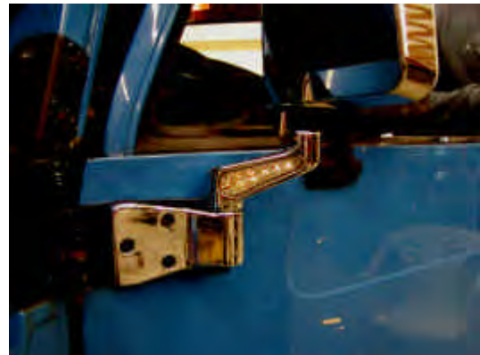
Figure 11. The initial systems checks proved that all lighting functioned properly, and our Jeepin' buddies were impressed with the cool new looks.