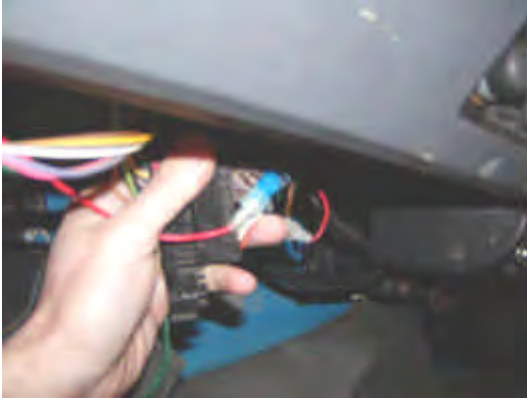
Figure 8. Use the crimp-on splice connector and spade terminal to make the wiring connection. The RED (Turn) on the left mirror is being spliced into the necessary wire on the turn signal switch harness. The same splices were done for the remaining turn, and park wires.

Gray/Black, RIGHT into the Brown, both on the turn signal switch harness. The colors and locations may be different on other vehicles. Use the test light to carefully test and locate the required wires.