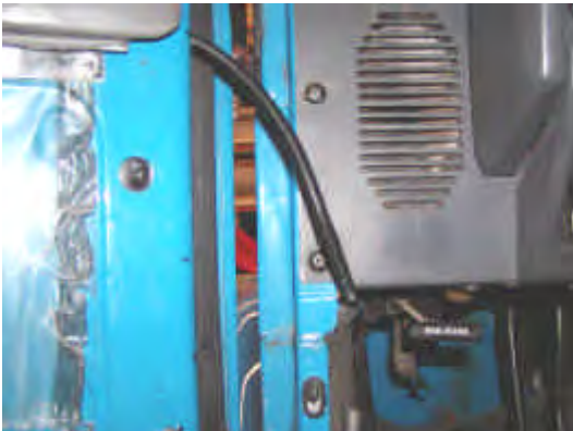
Figure 5. The wires and loom can then be pulled through the door, and the mirror fastened to the door. Be sure to leave the wires long enough to provide for full door movement. Then install the provided male 4-pin plug and terminals. Wiring these plugs

into the system will make future door removal quick and easy.