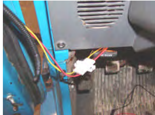
Figure 10. The final installation steps. Be sure wires correspond on both plugs. Place wiring in the loom. Tuck plugs behind dash. Test all light functions.

Once these connections have been made the wires can be routed to the right and left sides of the vehicle; proper length can be determined, and the plugs can be installed. Make certain that both the male and female ends of the plugs are wired to correspond correctly.