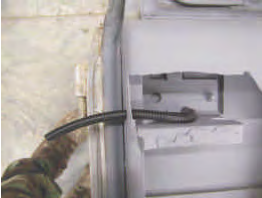
Figure 4. This cut-away of a door shows the required location of the second hole. It was necessary to locate the hole nearer the inside of the door to avoid hitting the lower section of the window channel. The wire loom shows the desired wire routing.