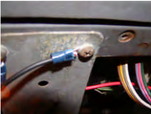
Figure 9. Terminals were crimped onto the Black ground wires and then they were placed under existing screws in the metal dash.

Once these connections have been made the wires can be routed to the right and left sides of the vehicle; proper length can be determined, and the plugs can be installed. Make certain that both the male and female ends of the plugs are wired to correspond correctly.