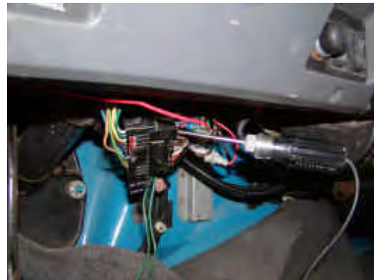
Figure 7. Locate and determine the wires needed. A wiring diagram and/or test light will be helpful.