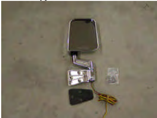
Figure 1. Kit includes one each of RIGHT and LEFT mirrors, all required wiring and hardware.

This mirror kit is designed to enhance the appearance of your Jeep. This kit can be used on all Wranglers, with half and full doors. Some models may require upper door hinges that are machined to accept the mirrors. The mirrors can be wired to operate with vehicle turn and/or parking lights. Installation and wiring processes may vary slightly based upon the model, year, and door type.