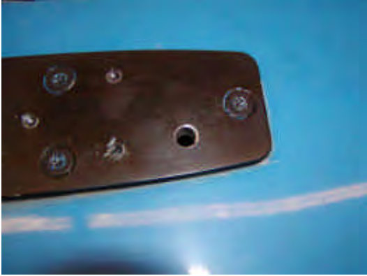
Figure 3. The first hole needs to be drilled in this location through the hinge and outer door.