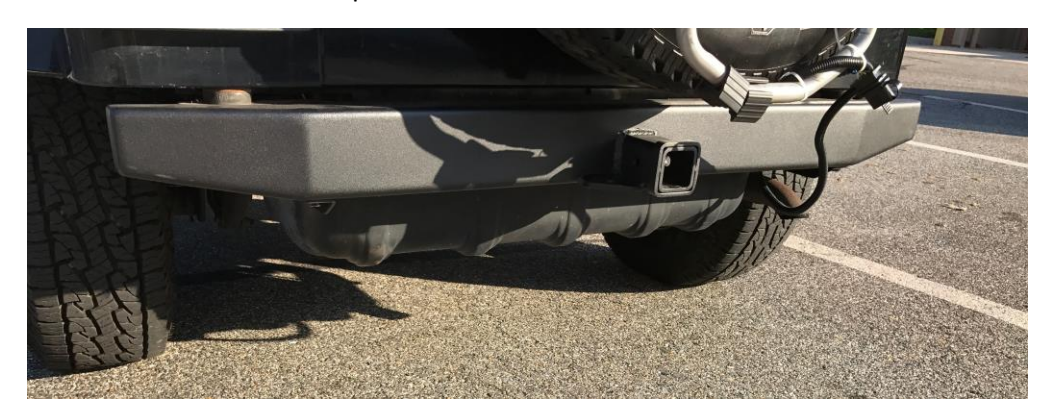
Installation Instructions Written by ExtremeTerrain Customer Doug Lamude 10/19/2016

7. Fully tighten all nuts and bolts to complete installation.