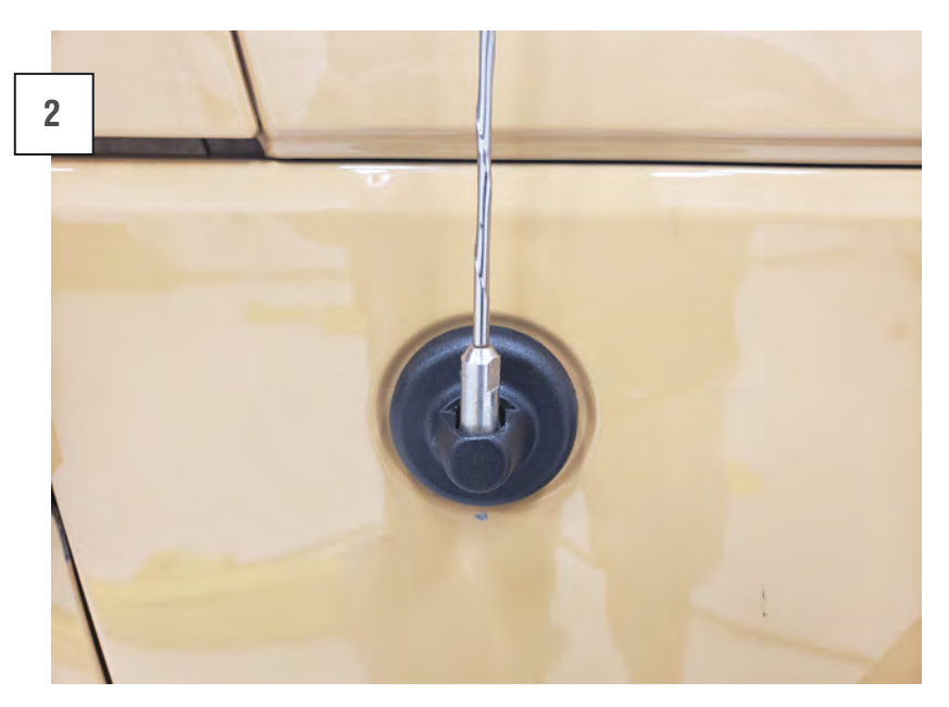
Carefully twist the antenna counter-clockwise to remove. Remove the factory antenna.

Locate the factory antenna and antenna base.