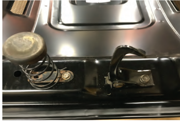
//Step 7: Install the hood spring and safety latch by reusing (1) 8mm bolt for the hood spring, and (1) 10mm bolt for the safety latch.