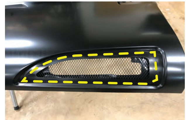
//Step 10: Clean the highlighted area with isopropyl alcohol.