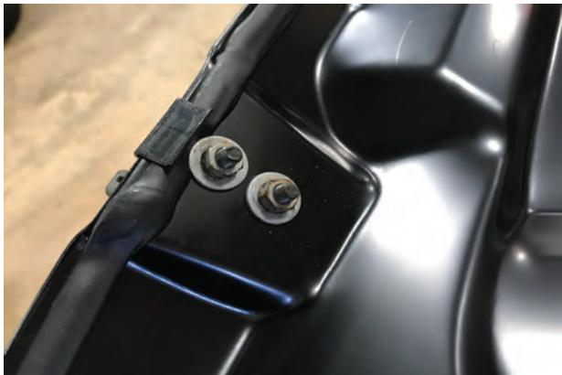
//Step 6: Install the (2) hood latch brackets to the new hood by reusing (2) 10mm nuts per side.