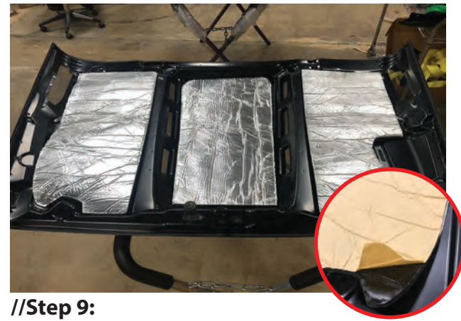
//Step 9: Install the (3) heat insulation pads onto the hood. Peel the film back and apply the adhesive to the hood after cleaning with isopropyl alcohol.