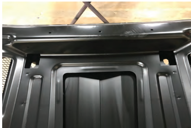
//Step 8: Install (2) washer nozzles into the hood until they click into place.