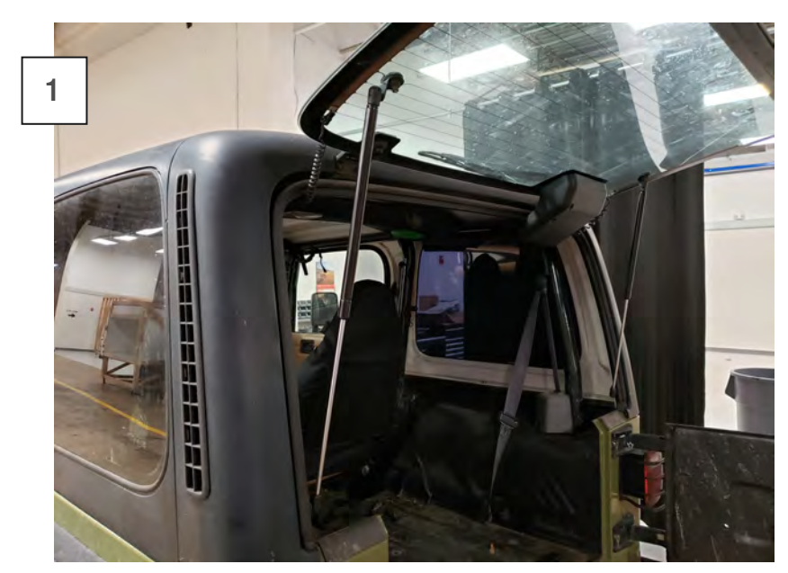
Open the rear tailgate to gain access to the lift gate supports.