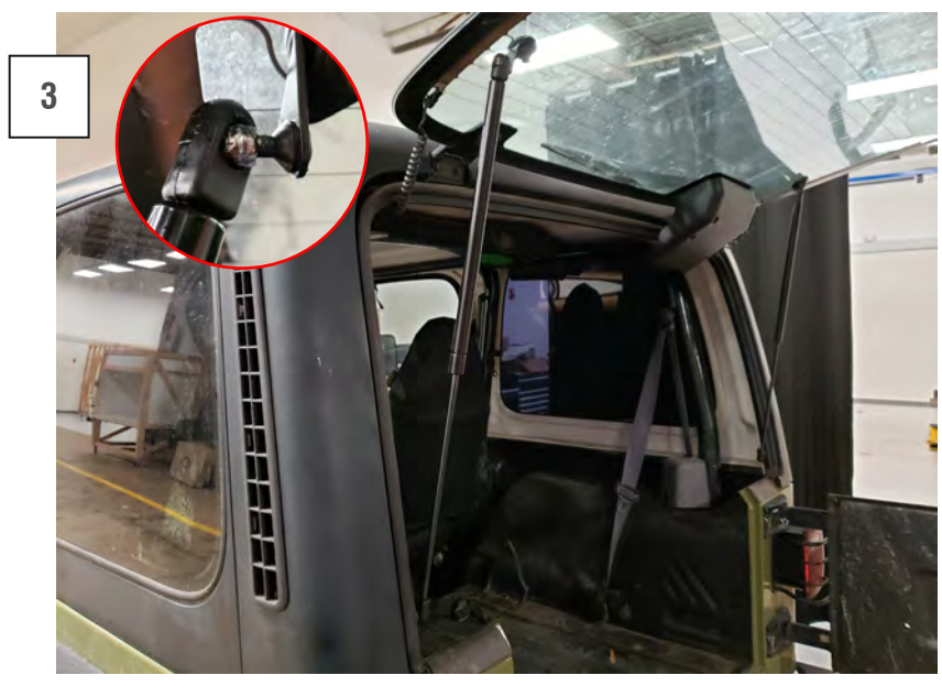
Carefully press the new support over the ball socket until it clips in place. Repeat this for the top and bottom of each support. Installation is now complete.