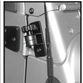
TJ-LJ Install pic.9

Step 7. When doors are reinstalled remove mirror arm from bracket. Place bushings back into arm. Tighten knob. (pic.8-9)