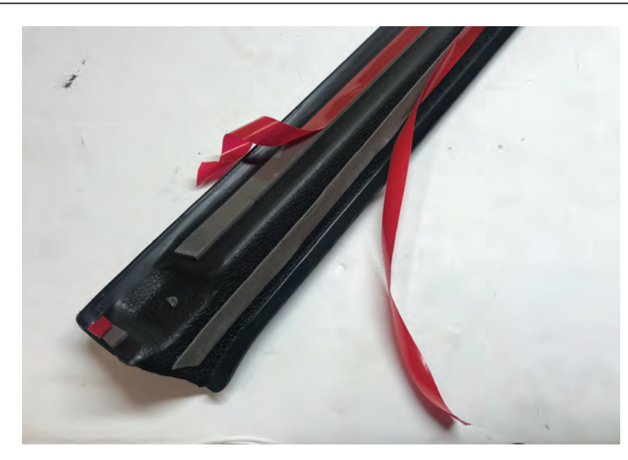
// Step 2: Once surface is clean, peel back the film on the double sided tape to expose the adhesive that will go towards the vehicles surface.