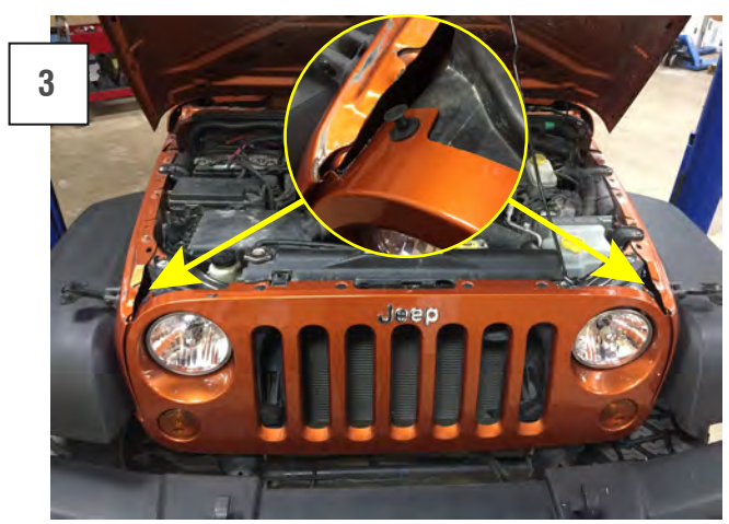
Using a soft pry tool, remove the (2) plastic push clips, (1) on either side of the grille. These will be reused to attach the Brow. Test fit the Brow before removing the tape backing.

Open and support the hood. Locate the factory weather stripping. Using a soft tool, pry the weatherstripping off the factory grille. Factory weatherstripping will not be reused. **Note: If there is any remaining adhesive on the paint. A quality adhesive remover will need to be used to remove the remaining adhesive.