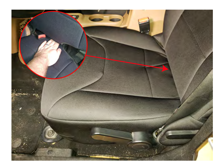
Step 4\\ Install the lower portion of the seat cover to the seat. Tuck the two buckles through the upper and lower seat joint. Route the straps under the seat from front to back. Tuck the seat cover around the seat lever.