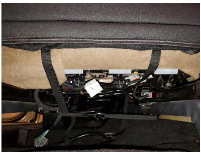
Step 5\\ Connect the (2) front to back and (1) side to side clips to secure the seat cover to the lower portion of the seat. Then pull tight on the strip to ensure the seat cover is tight to the seat.