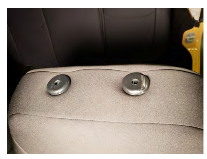
Step 3 \\ Once the upper portion of the seat cover is installed, tuck the seat cover under the tabs for the headrest guides.