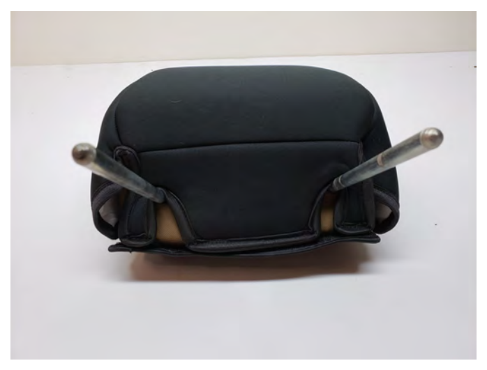
Step 1\\ Begin by removing the headrest on each side, and sliding over the new headrest covers. Secure the cover to the headrest by velcroing them in place.

Seat Covers (13-18 JK 2-Door) (18+ JL 2-Door)