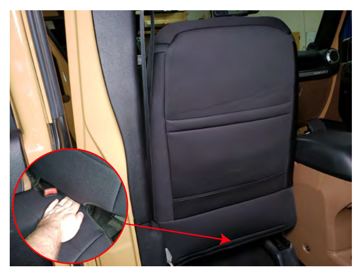
Step 2\\ With the headrest still removed, pull over the upper seat cover portion and secure by tucking the velcro sleeve in-between the upper and lower part of the seat to the back to velcro in place.