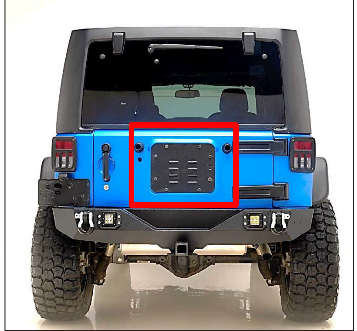
Product shown installed on Jeep JK