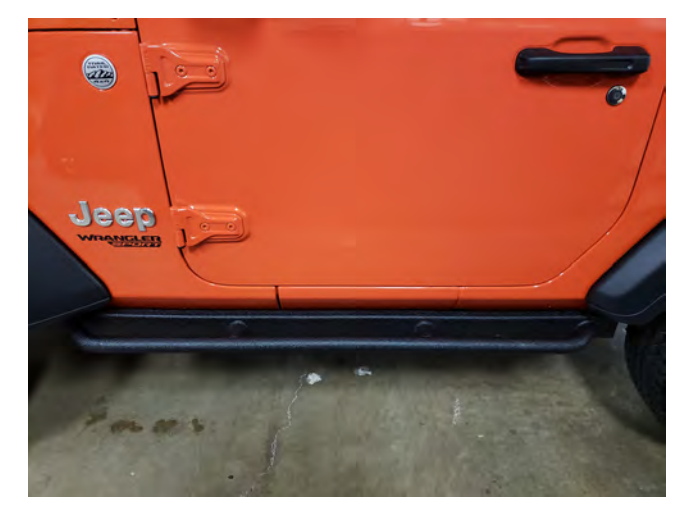
STEP 7 // Double check installation to make sure everything is tight. Installation is now complete.

Once the Enhanced Rubi Rails are tight to the pinch welds, install the (2) M8x1.25x35mm bolts, flat washers, and lock washers through the body mount brackets.