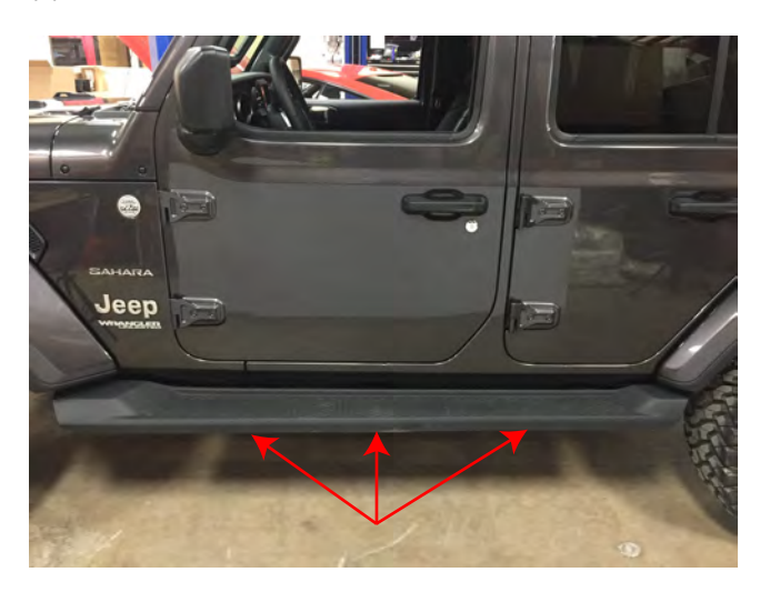
STEP 1 // Begin by locating the (3) pinch weld mounting locations under the vehicle.

(1) Driver Side Rubi Rail (8) M6 Nuts (1) Passenger Side Rubi Rail (8) M6 Flat Washers (4) M8x1.25x35mm Bolts (4) M8 Lock Washers (4) M8 Flat Washers