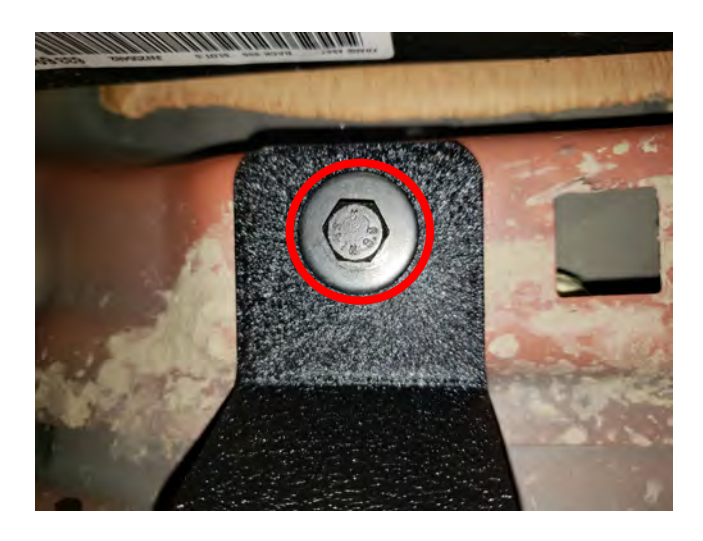
STEP 6 // Once the Rubi Rails are tight to the pinch welds, install the (2) M8x1.25x35mm bolts, flat washers, and lock washers through the body mount brackets.

Position the new Rubi Rail with the pinch weld mounting holes and insert through the holes. Tighten the Rubi Rail using the (4) M6 nuts and washers to the pinch welds. **Due to vehicle manufacturing variances, it may be necessary to use the supplied spacers between the rubi rail and pinch weld. Begin by test fitting the part with no spacers. If the slider makes contact with the vehicle, start by using 3mm spacer and test fitment again. If contact is still occurring install the 5mm spacer. Use the least amount of spacers as possible to achieve desired fitment.