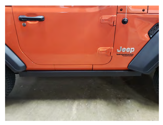
STEP 7 // Double check installation to make sure everything is tight. Installation is now complete.