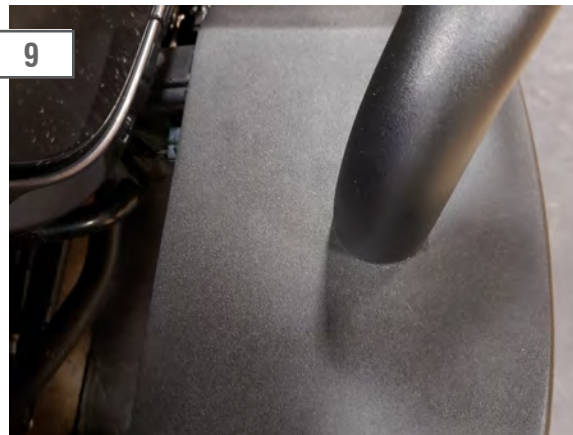
9 Install the optional override bar to the bumper using the (4) M8x1.25x25mm bolts, lock washers, and flat washers.