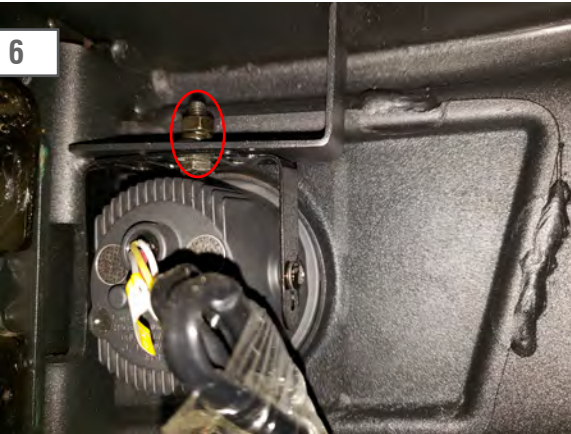
6 Install the (2) fog lights to the bumper using the (2) M6x0.8x16mm Bolts