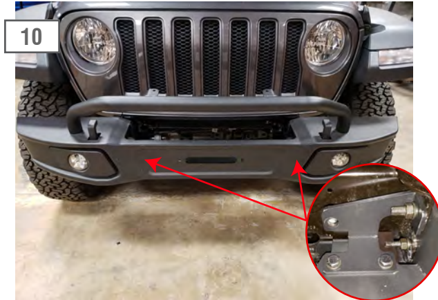
10 Insert the bumper through the front of the winch plate, and through the frame rail mounts. Next insert the (2) winch plate brackets. Secure the front bumper to the vehicle using the (4) M10x1.5x35mm bolts, (8) M10 lock washers, (8) M10 flat washers, and (4) M10 nuts. Torque to 40 ft-lbs.