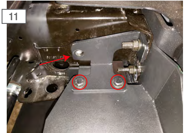
11 Secure the (2) winch plate brackets to the winch using the (4) M10x1.5x50mm bolts, (4) lock washers, (8) M10 flat washers, and (4) M10 nuts. Then insert the (2) M10 x 1.5 x 35mm bolt into each side of the bracket and into the frame rail. Torque to 40 ft-lbs.