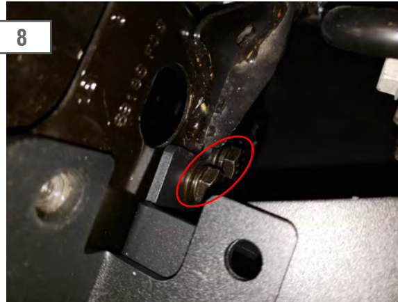
8 Install the winch plate to the frame rail brackets installed in the last step using the supplied (4) M12x1.75x30mm bolts, lock washers, and flat washers. Torque to 40 ft-lbs.