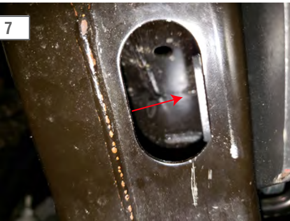
7 Insert the (2) frame rail brackets (1) for each side into the frame rail pocket. Make sure the (2) bolt holes line up with the holes in the frame rail.