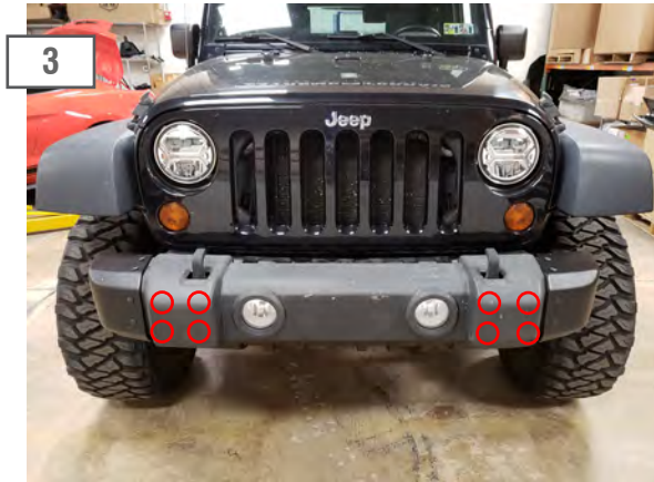
From under the vehicle, access and remove the (8) 18mm nuts securing the factory bumper to the vehicle.