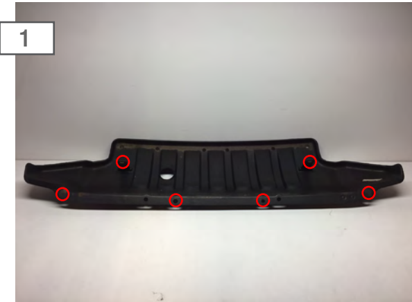
Remove the (6) plastic push pins securing the factory splash shield to the vehicle. (4) Across the front edge, (2) on the rear edge.