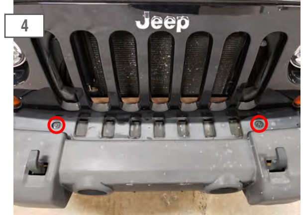
From under the vehicle, access and remove the (8) 18mm nuts, and (4) 18mm bolts securing the factory bumper to the vehicle. Then fully remove the bumper from the vehicle.