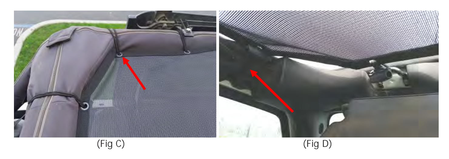
Step 5: Once the front and rear corners are all fastened proceed to fasten remaining points using the long cards. It is recommended to alternate from side to side when doing so.

Part # J126523 (07-18 JK 4 Door) Cloak Extended Mesh Top