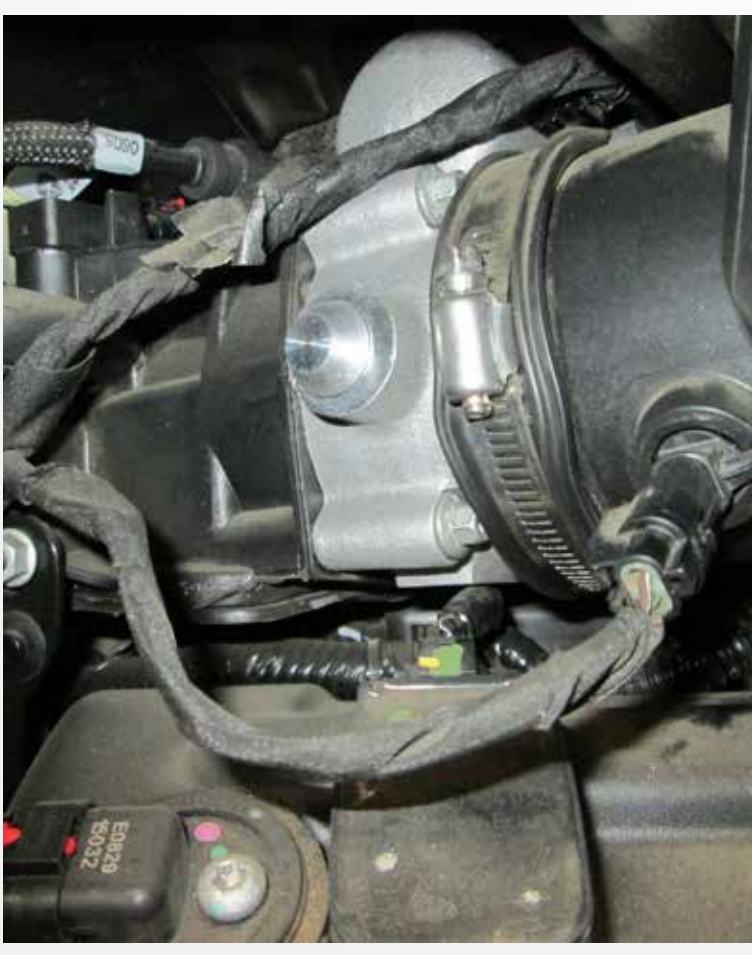
Re-install throttle body control plug, air temperature plug and intake tube back on to BBK throttle body.

THEN RE-INSTALL NEGATIVE BATTERY TERMINAL AND FOLLOW RE-LEARN PROCEDURE - SEE NEXT PAGE.