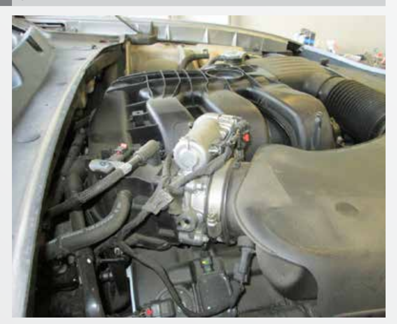
Disconnect the air temperature sensor plug and throttle body control plug.