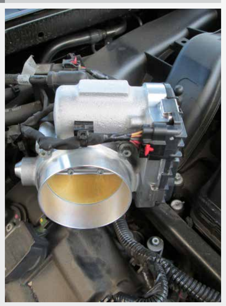
Now bolt on BBK throttle body re-using stock hardware making sure to not over tighten stock bolts.