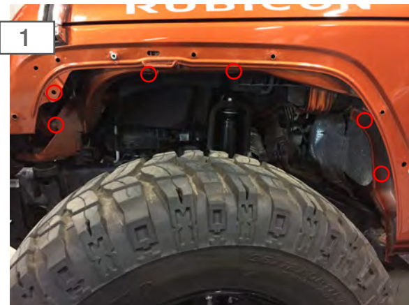
1 Locate the mounting locations on the fender well.