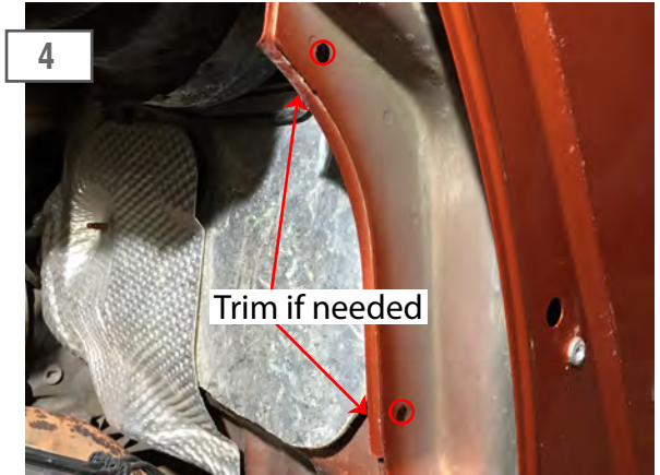
4 Drill a 1/8" pilot hole and then drill the holes to 3/8". Install the supplied clip nuts. **Note: It may be necessary to trim the inner fender lip in order to slide the clip nut on.