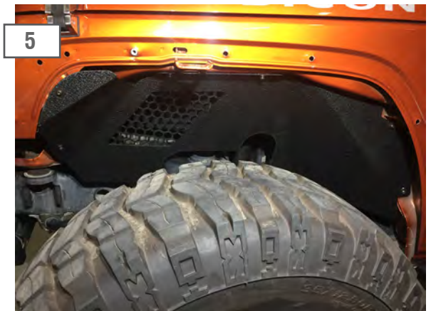
5 Install fender liners using the supplied bolts, lock washers, and large washers.