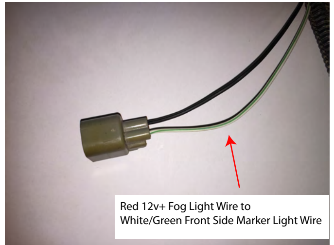
Red 12v+ Fog Light Wire to White/Green Front Side Marker Light Wire

Supplied Harness - Factory Wiring Harness Yellow - Headlight switched 12v+ (white w/green headlight harness wire)