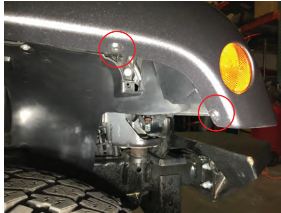
Step 2 Using a small Phillips head screwdriver, firmly press the center out of the (2) push pins circled above. Then use a panel removal tool to remove the remaining fastener.