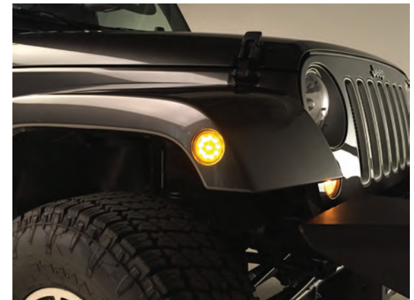
Step 6 Reinstall the fender liner and push clips in reverse order.