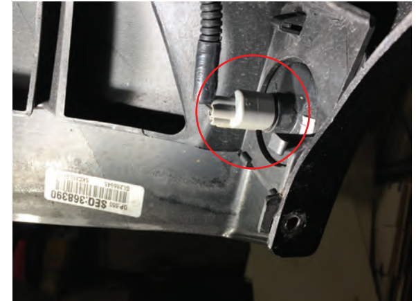
Step 3 Fold the splash shield out of the way to access the marker light plug. Unplug the light and tuck the wiring harness out of the way.