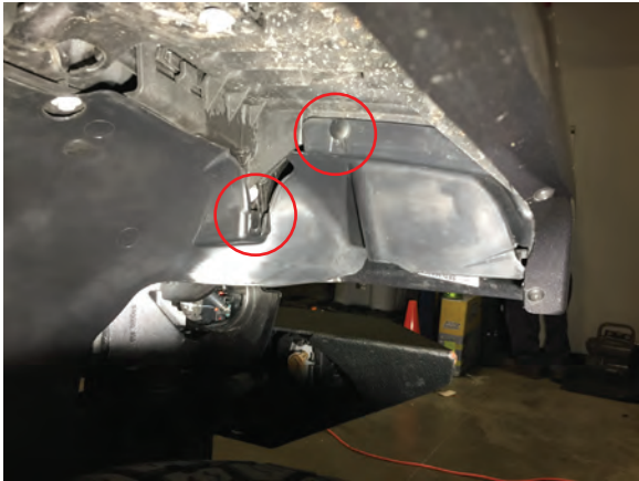
Step 1 Using a panel removal tool, remove the (2) push clips holding the inner splash shield.