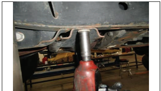
Tighten transfer case skid plate bolts, reinstall wheels