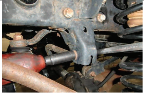
Support front axle and remove upper trac bar bolt.