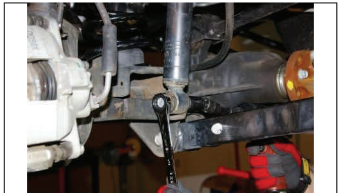
Reattach lower shock mount and tighten