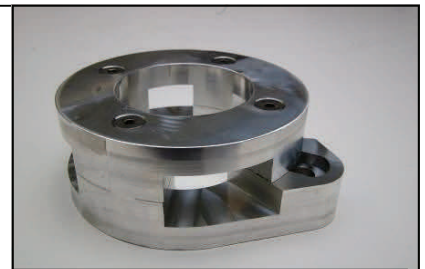
Config. C = 2.0" Lift

Assemble the desired amount of lift ( 1.0", 1.5", 2.0" ) based on the vehicle's stance.