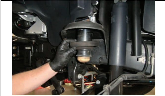
Remove the upper spring isolator to expose mounting hole