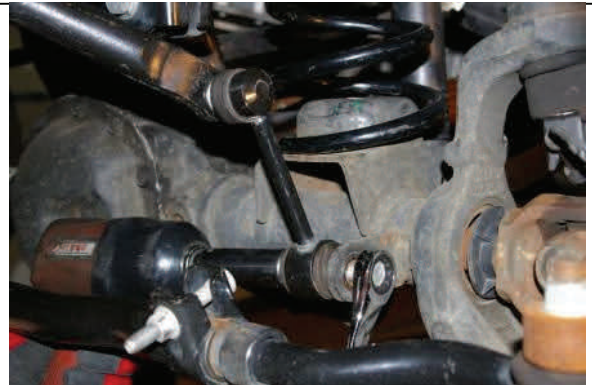
Disconnect dr./pass. lower front swaybar end links