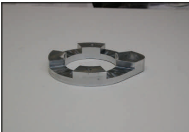
Config. A = 1.0" Lift