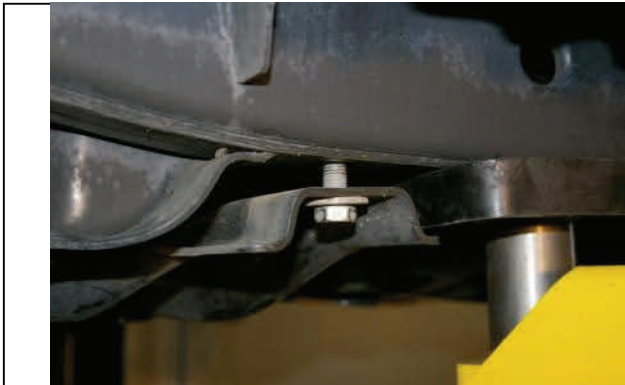
Loosen (2) front transfer case skid plate bolts.