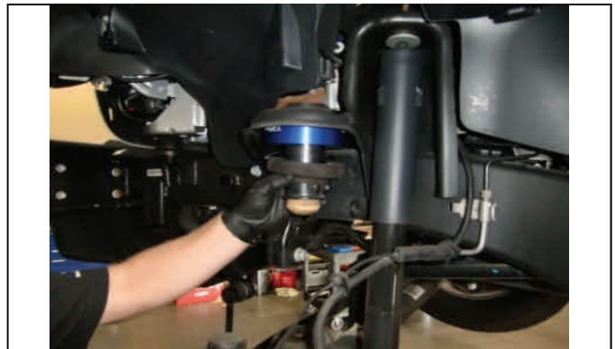
Tighten bolt and reinstall rubber isolator as shown