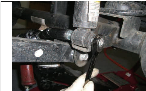
Disconnect and remove front lower shock hardware.