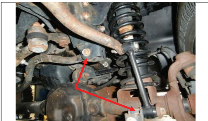
Reconnect lower swaybar endlinks and trac bar bolt