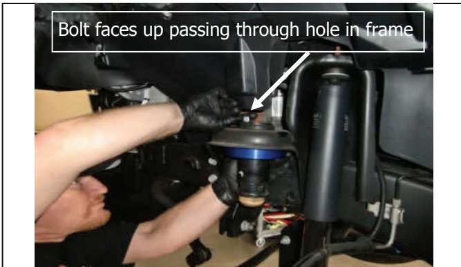
Attach spring spacer kit with provided hardware