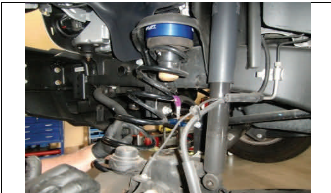
Reinstall coil spring in vehicle and raise axle