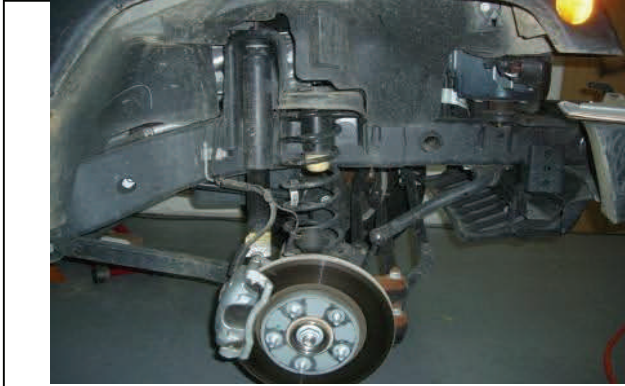
Securely raise vehicle off ground and remove (4) wheels