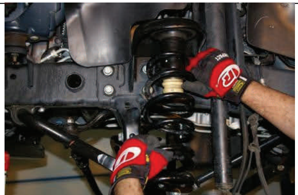
Carefully lower front axle enough to remove front spring