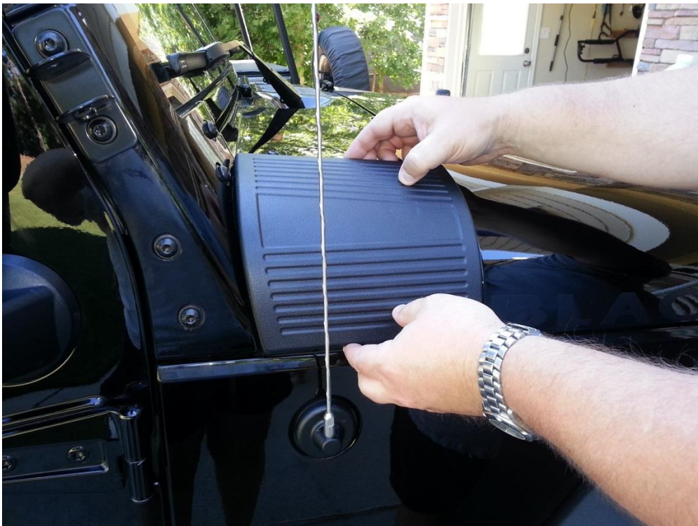
(Pic 5 Passenger Side)