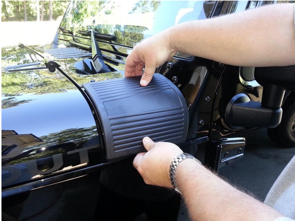
(Pic 4 Driver Side)