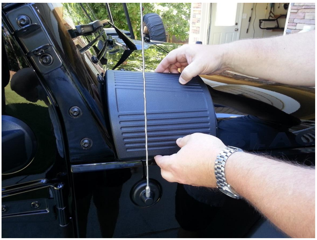
(Pic 5 Passenger Side)