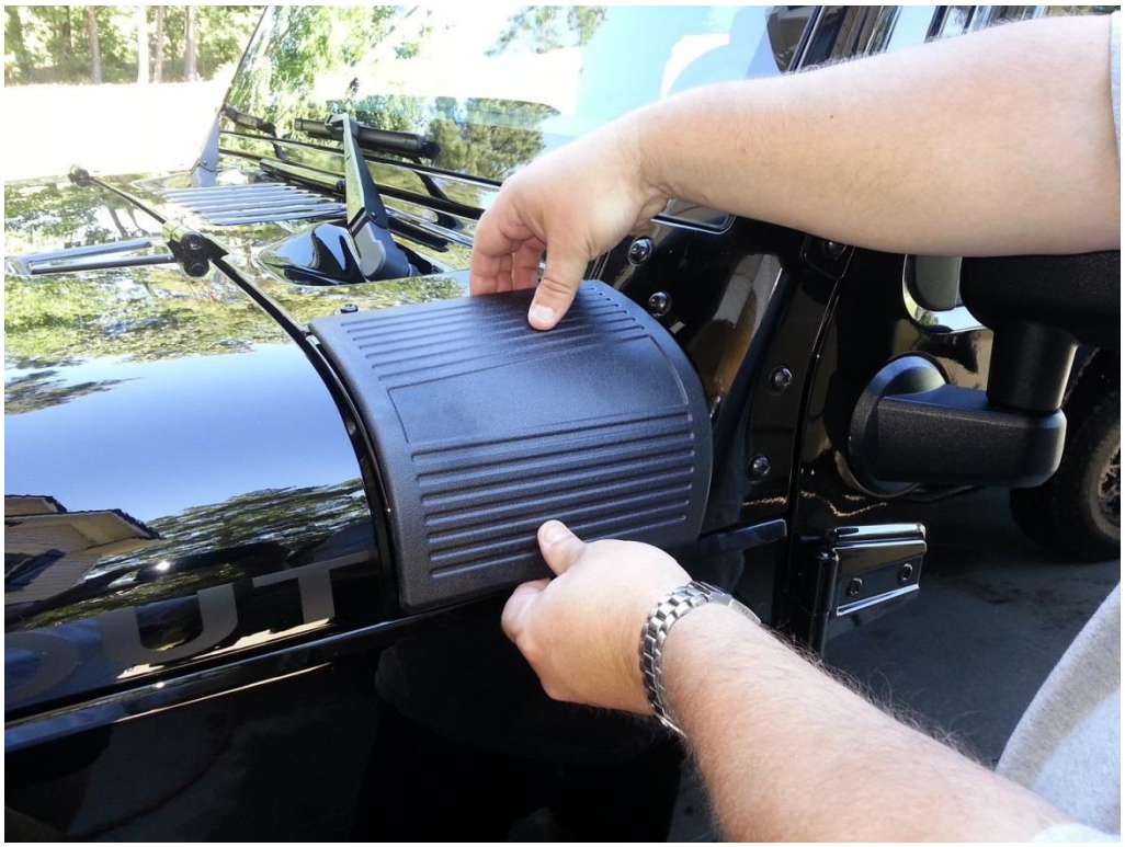
(Pic 4 Driver Side)

4. Start with the diver side. Align the Cowl Body Armor over the cowl. Use your finger tips to find the edges. Once the part is lined up, press firmly to attach the piece. Press evenly around all four sides to secure the parts. Follow the same process for the passenger side. (Pic 4A & Pic 4B)