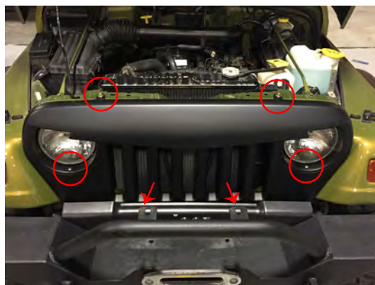
Step 5\\ Install the grille cover using the factory headlight trim screws. Use the provided nuts, bolts, and washers on the upper and lower mounting locations.