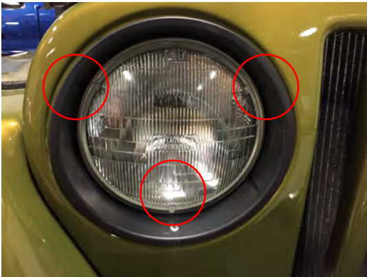
Step 3\\ Remove the (3) screws securing the headlight trim to the vehicle.