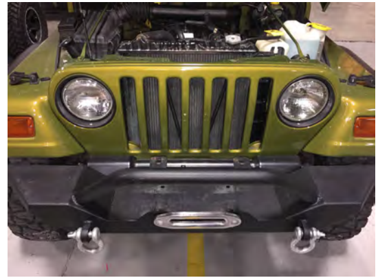
Step 2\\ Wash the grille and surrounding areas with soap and water. Allow the grille and surround areas time to dry. **Recommended: Wipe the cowl with isopropyl alcohol to ensure the cleanest surface possible.