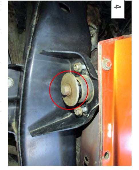
bolts from the vehicle. Using a 18mm socket remove the body mount

more clearance please add the supplied bracket spacers to provide Note: If sliders contact the vehicle after installation, Place the plate-nut brackets into the slider. The handle will be used to align the plate in step 6.