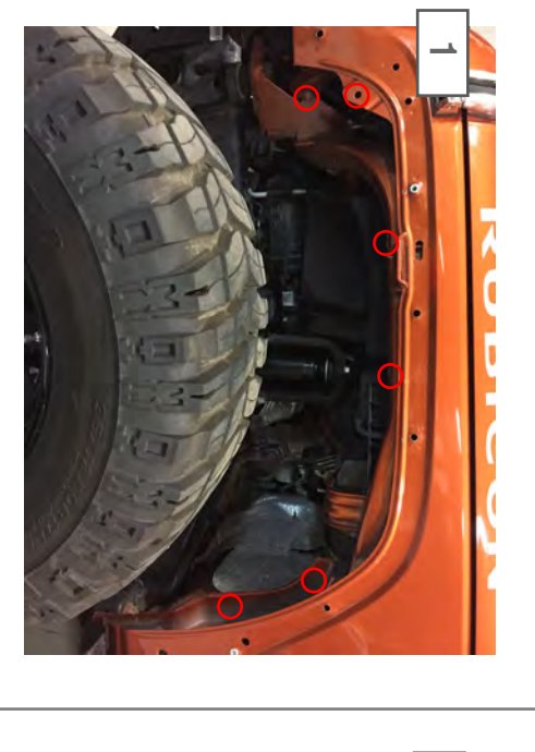
Locate the mounting locations on the fender well.