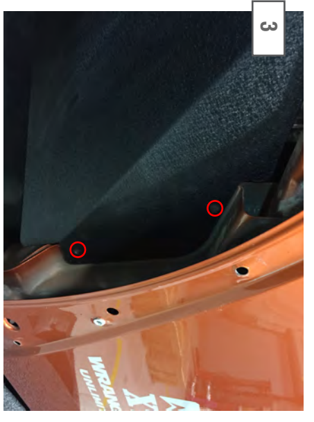
correct location. factory 10mm nut now that the bracket is in the supplied Allen bolts. Using a marker, mark the hole Loosely install the inner fender liner using the to be drilled. Remove the fender liners. Tighten the locations on the rear most holes. These will need