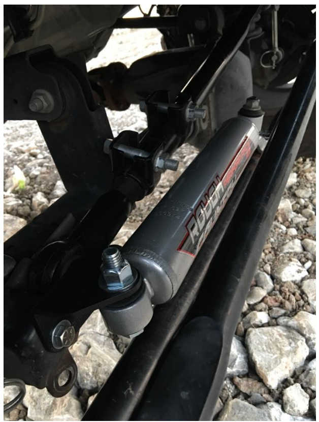
Installation Instructions Written by ExtremeTerrain Customer JeepModReview 03/21/2017