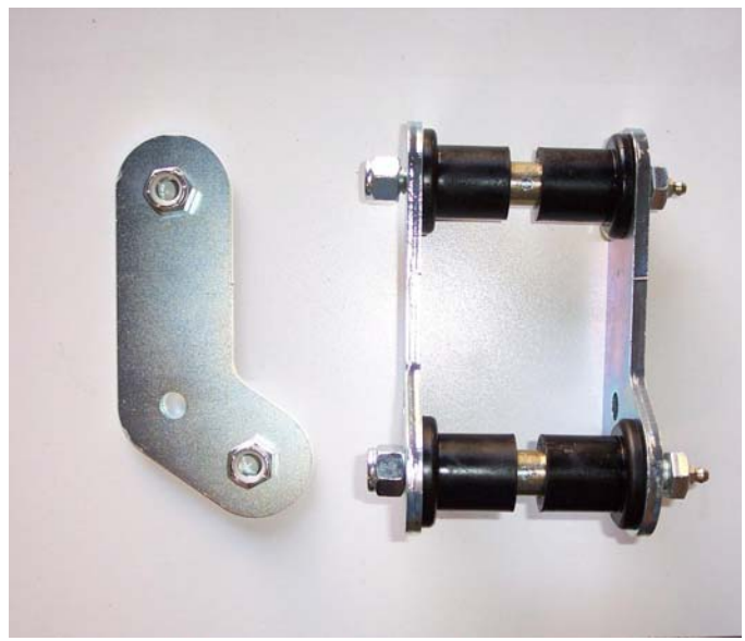
< KNEE TOWARD FRONT - PHOTO 6 - SHORT LEG TO SPRING >