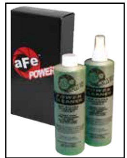
Pro DRY S Restore Kit