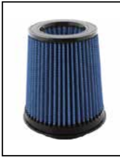
Pro 5R Air Filter