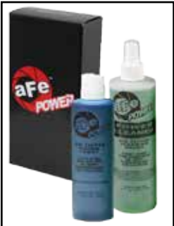
Blue Squeeze Restore Kit