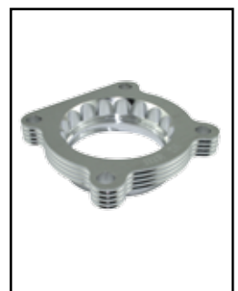
Throttle Body Spacer