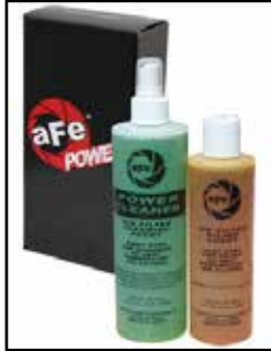
Gold Squeeze Restore Kit