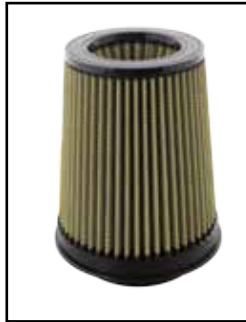
Pro-GUARD 7 Air Filter