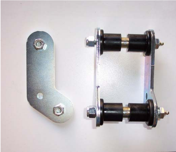
< KNEE TOWARD FRONT - PHOTO 6 - SHORT LEG TO SPRING >

Caused by improper relationship of drag link and track bar. This is not typically a problem with the included track bar bracket and drop pitman arm.