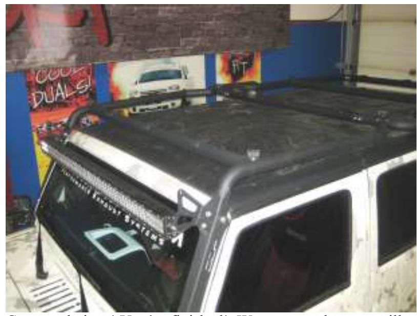
Congratulations! You're finished! We are sure that you will enjoy this Off Camber Fabrications product by MBRP Inc.