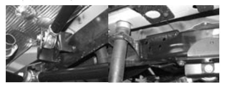
Figure 7A Figure 7B