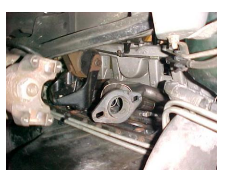
7. RE-INSTALL MOTOR MOUNT. (ONLY ON CHEROKEE MODELS) PLUG IN O2 SENSOR, INSTALL NEW SUPPLIED DONUT GASKET FOR HEADPIPE CONNECTION. THEN ATTACH HEADPIPE TO HEADER WITH NEW SUPPLIED EXHAUST DONUT.TORQUE HEADPIPE TO 30-35 FTS.

6. INSTALL GIBSON HEADER WITH SUPPLIED GASKET. AFTER HEADER IS BOLTED UP ON BOTH ENDS OF HEAD. INSTALL INTAKE MANIFOLD BACK ON, TORQUING ALL FASTENERS TO 35 - 35 FTS.