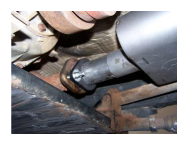
2. To remove the stock exhaust, unbolt the 2-bolt flange located in front of the muffler. Disengage the welded hangers from the OEM rubber grommets. Use WD-40 to aid in this process. Do not damage or remove the rubber grommets as you will reuse them to mount your new system. Now cut off tailpipe and remove exhaust.

1. Disconnect the negative battery cable before removal of OEM exhaust. This will allow the computer to reset and recognize the new exhaust. Lay out the exhaust on the floor so it looks like the drawing and compare parts with manual.