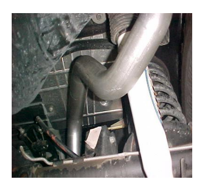
TAILPIPE #B INTO THE MUFFLER 1 ½" TO 2". SECURE TO THE MUFFLER USING CLAMP #D. DO NOT TIGHTEN. INSERT WELDED HANGERS INTO RUBBER GROMMETS. NOTE, SHORT END OF OVER AXLE PIPE INSERTS INTO MUFFLER.

LAY OUT THE GIBSON EXHAUST ON THE FLOOR SO IT LOOKS LIKE THE DRAWING AND COMPARE IT TO THE MANUAL. TO REMOVE THE STOCK FXHAUST CUT OFF TAILPIPE JUST BEHIND THE MUFFLER THEN REMOVE MUFFLER FROM 2- BOLT FLANGE JUST IN FRONT OF MUFFLER, LEAVE ALL RUBBER GROMMETS IN PLACE, USE WD-40 TO AID IN REMOVAL OF EXHAUST AND HANGERS.