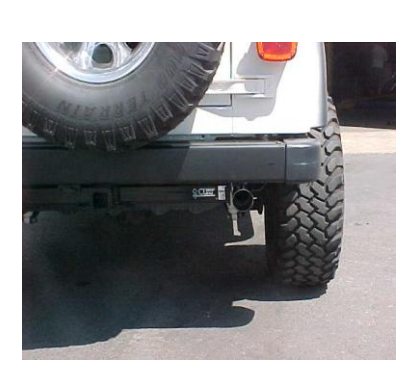
INSTALL STAINLESS STEEL TIP. CLAMP DOWN. WHEN YOU HAVE EVERYTHING IN PLACE, FIRMLY TIGHTEN ALL BOLTS AND CLAMP DOWN SECURELY. TO CLEAN STAINLESS TIP, USE A SCOTCH BRITE PAD AND ANY STAINLESS STEEL OR ALUMINUM CLEANER.

MAKE SURE YOU HAVE A 1" CLEARANCE ON ALL BRAKE LINES, FUEL LINES, SHOCKS, TIRES, ETC.