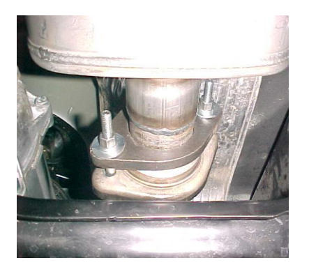
ATTACH MUFFLER ASSEMBLY #A ONTO YOUR EXISTING STOCK FLANGE. USE BOLT KIT # E TO SECURE TO FLANGE. USE A JACK STAND TO SUPPORT THE MUFFLER.