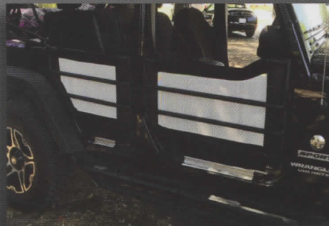
Trail Door "Skins"