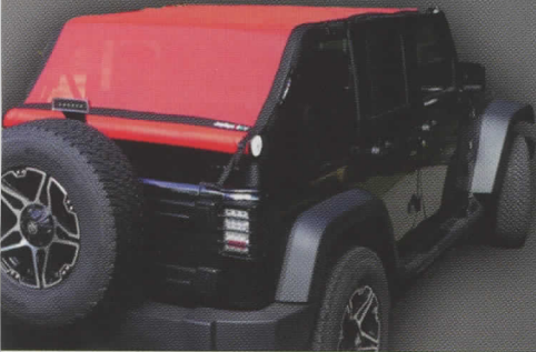
"Shader Style" Full Length

WWW.JEEPTOPSUSA.COM SUPPORT@JEEPTOPSUSA.COM 469-532-0808