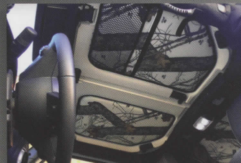
Hard Top "Headliners"