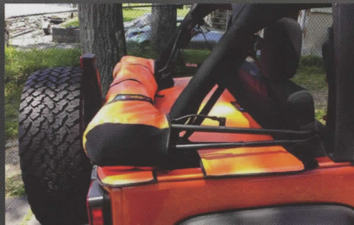
Soft Top and Tonneau Covers