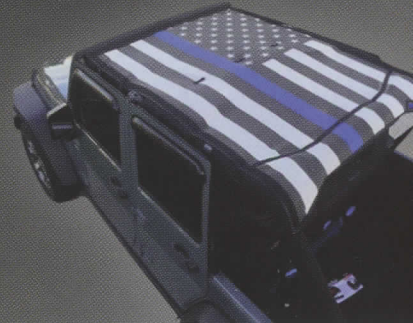
"Safari Style" 3/4 Length

See Our Full Line of Wrangler Products www.jeeptopsusa.com