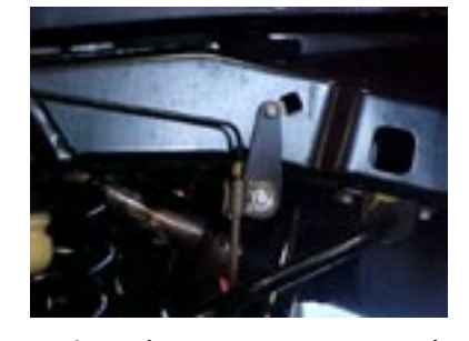
11. Complete steps 1-10 on the other side of the vehicle.