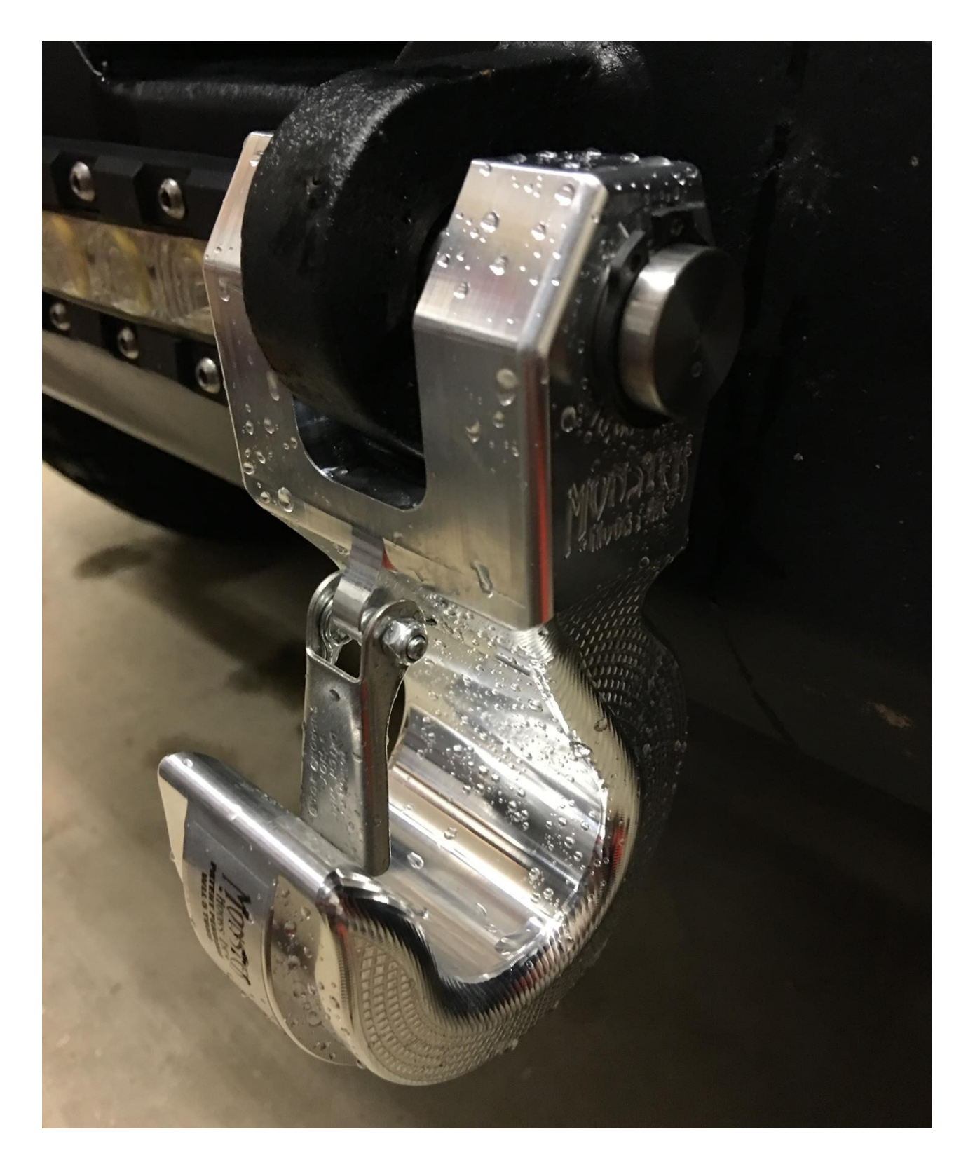
Installation Instructions Written by ExtremeTerrain Customer JeepModReview 08/18/2016