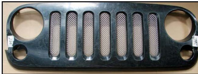
Figure 2 – Front View of positioning Grille