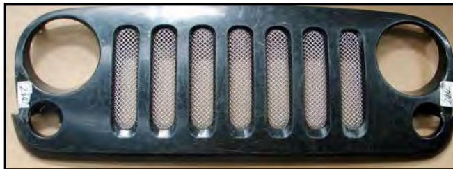
Figure 2 – Front View of positioning Grille