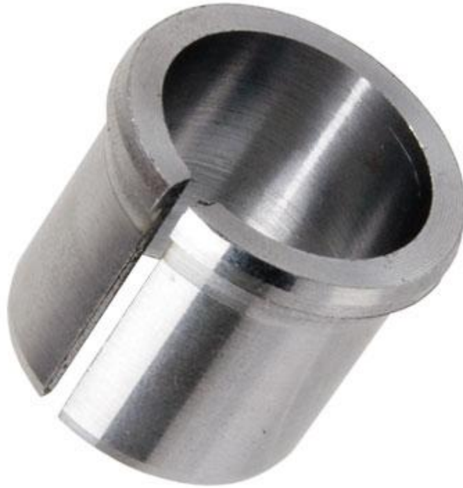
PPM-8001-02-01 (13/16" drill bit)