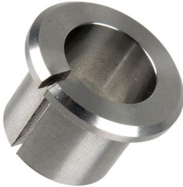
PPM-8001-03-01 (7/8" drill bit)