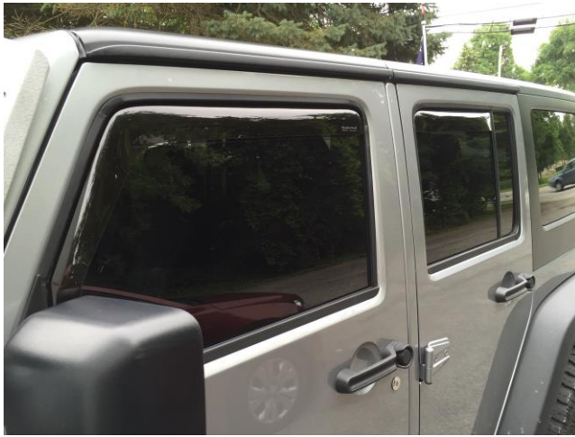
Step Thirteen: Onto the passenger side, repeat steps two through eleven to complete the passenger side (see below for before and after pictures of the passenger side)