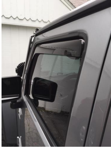
Step Eight: Now the driver side window is complete, now onto the driver side rear door

Step Nine: Remove the adhesive backing on the deflector as shown below, the driver side rear door deflector has a notch cut out in the top right corner of it; start by putting it in on a 45 degree angle with the left side first and then the right