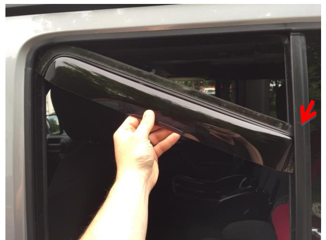
Step Ten: Push the deflector up into place like shown below with the thin machined flange of the deflector fully and evenly inserted into the window channel.