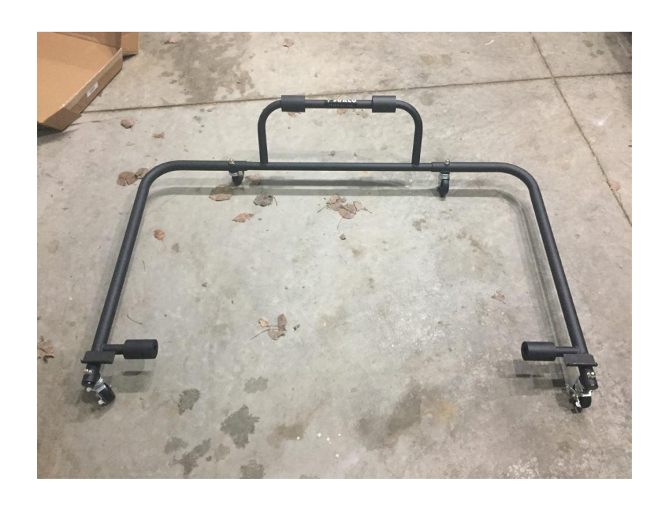
Installation Instructions Written by ExtremeTerrain Customer J. Sandlin 03/16/2017